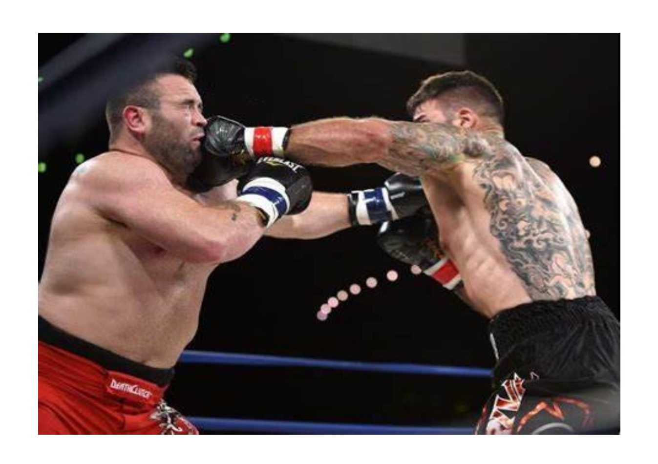
2021 Harris poll: 33% of US adults boxing fans, 30% fans of mixed martial arts